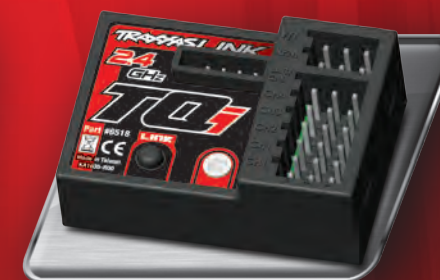
5-Channel Receiver With 3 Telemetry Ports