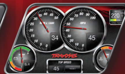
Telemetry Sensors Installed View speed, RPM, temperature, and voltage data on the Traxxas Link dashboard