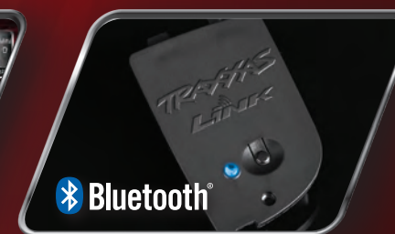
Traxxas Link™ Wireless Module connects with your iPhone, iPad, iPod touch, or Android*